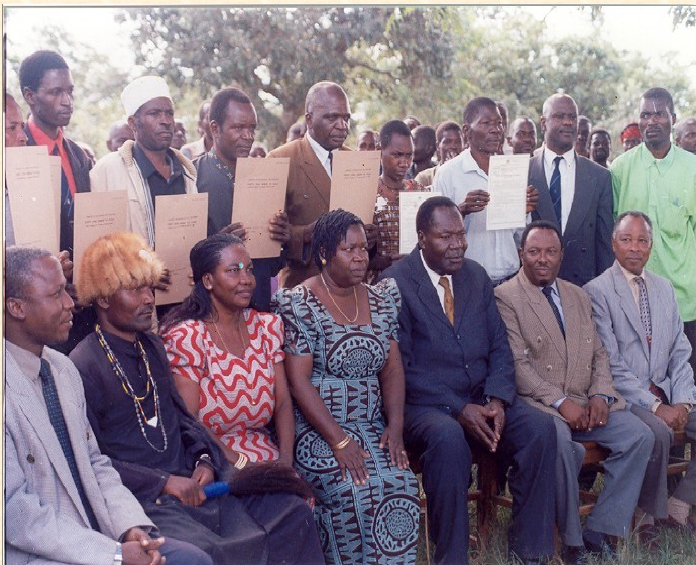
Villagers Issued with Certificates of Customary Right of Occupancy

To investigate the legal status of women and other vulnerable groups with regard to access to land.