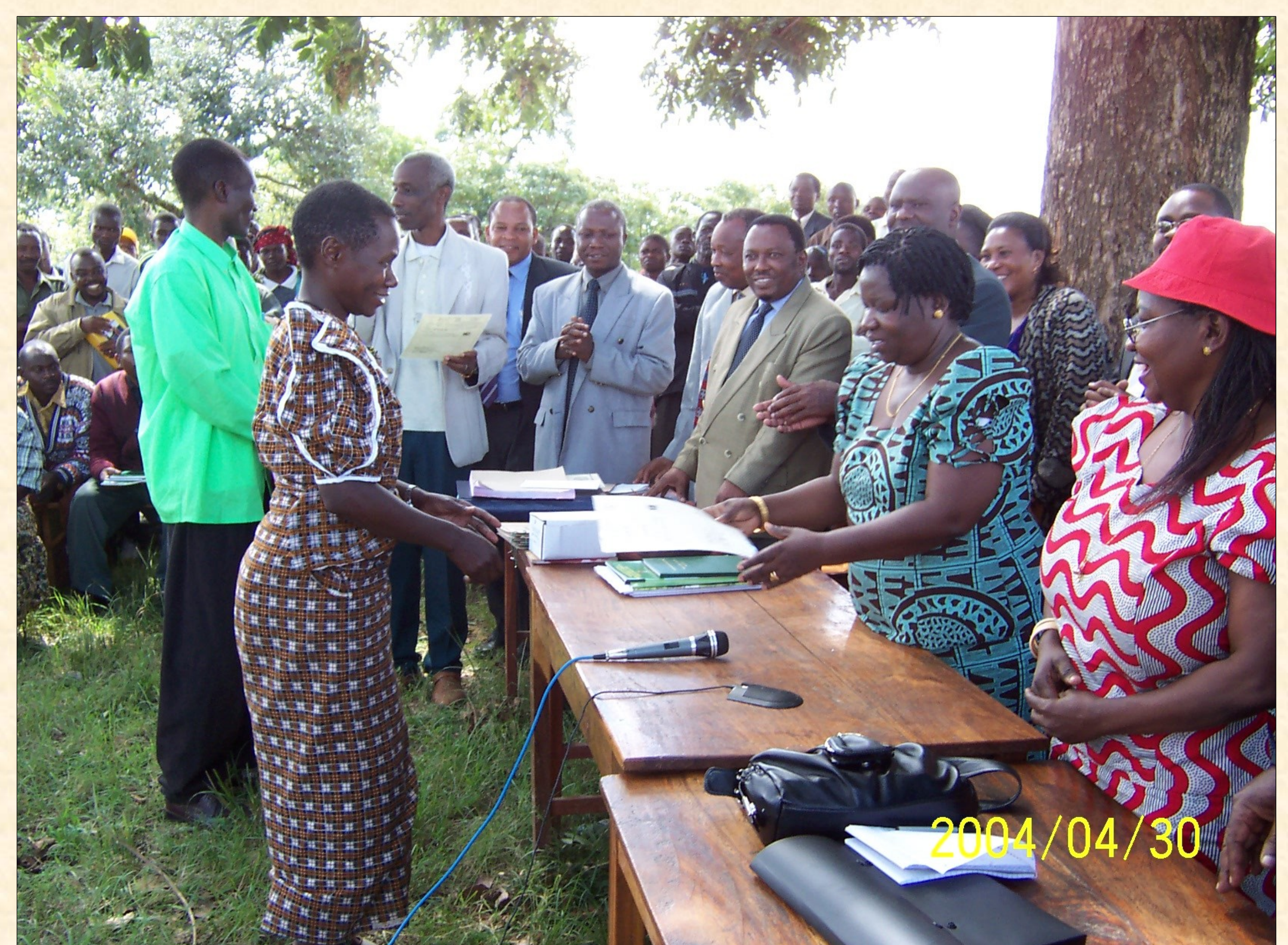
First Woman to be issued with Certificate of Customary Right of Occupancy

Land has a cross cutting effect in poverty reduction. There is therefore a need for coordination among various institutions.