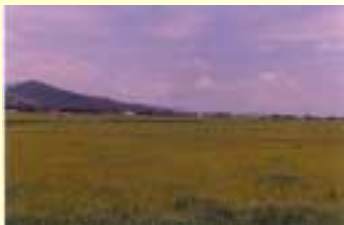
Land being converted to non-agricultural purposes near the highway