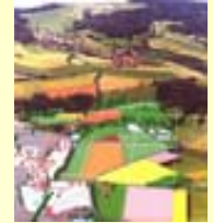
Centre of Land Management and Land Tenure