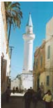
The old town- Tripoli

To determine what improvements the Libyan urban planning system needs in order to play its role in developing good urban areas and regions within the constraints of a capitalist economy and democratic political system, a case study approach has been applied. Benghazi City has been used as a case representing all Libyan cities and towns. The collected data include primary data based on semi-structured questionnaires for a number of stakeholders. Secondary data depend on several documented information, and site visits. The data obtained were compared and logically interpreted, and results were used to establish the final recommendations.