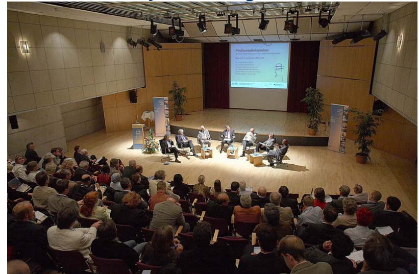
Conference “20 years Postgraduate Courses”

In 20 years: approx. 4,500 scholarships awarded