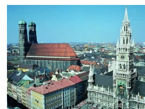
Munich's Frauenkirche and Neues Rathaus

Further information (applications, registration, etc.) will be provided in due time. For the time being, let us extend our invitation to all of you who may be interested in participating in this initiative.