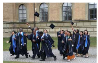
The Class of 2006

Program's homepage ( http://www.landmanagement-master.de )