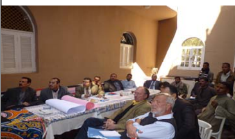
At the Workshop in Habu, Egypt