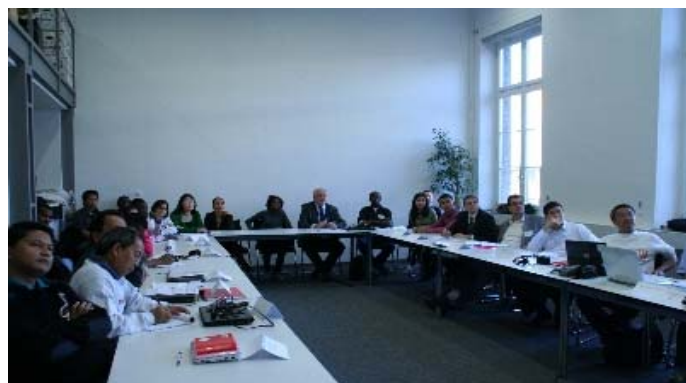
Participants of the Immersion Visit from the Philippines, TUM-ITC Team

To the effect of the ongoing collaboration project, TUM's Chair of Land Management hosted the delegation of academics from the Philippines. The group of guests was composed by a group of Professors from the Visayas State University and the University of the Philippines Diliman in Manila and a representative of the Department of Environment and Natural Resources of the Philippine Government.