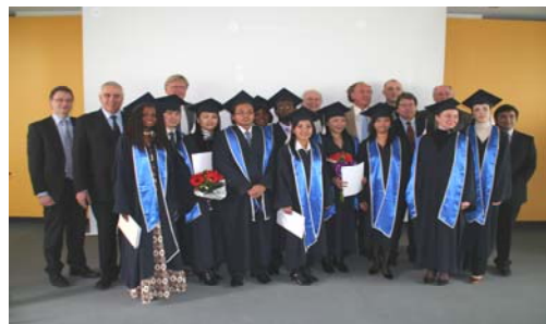
The Graduates and Lecturers

delivered a lively speech complete with the appreciation for the work done by the Chair of Land Management and its partners.